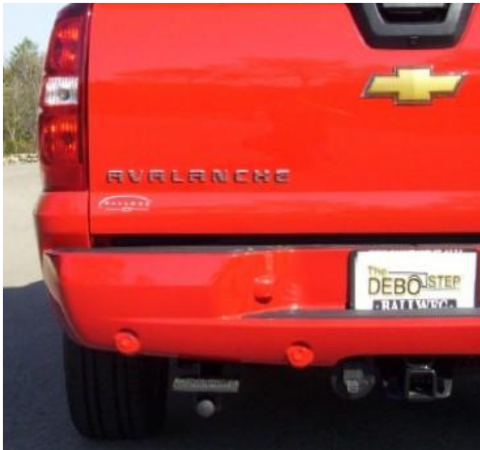
DEBO Step Installed, Stowed Position

Installation Instructions for DEBO Step Model 10701 Fits 02-11 Chevy Avalanche, With Factory Hitch or Equivalent