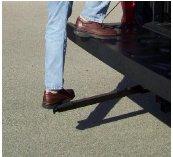
DEBO Step Extended for use with tailgate down.

Tools required for Installation: 1) Deep well socket, 21mm (13/16"), short extension, and handle, ratchet helpful. 2) Box or open end wrench, 21mm (13/16").