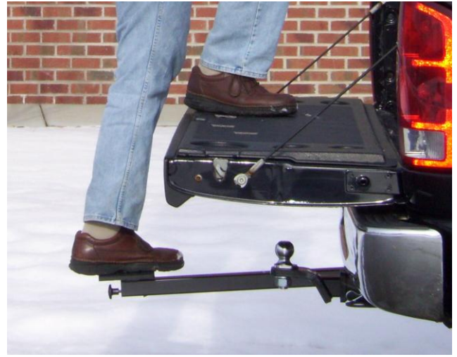
DEBO Step Extended for use with tailgate down.

Tools required for Assembly: 1) 7/16" wrench. 2) Wrench or pliers for 7/16" hex bolt head.