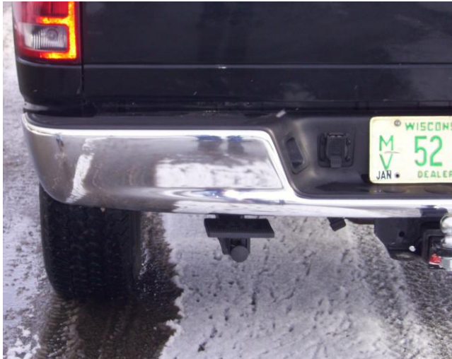
DEBO Step Installed, Stowed Position

Fits 03-08 Dodge Ram 1500, With or Without a Hitch.