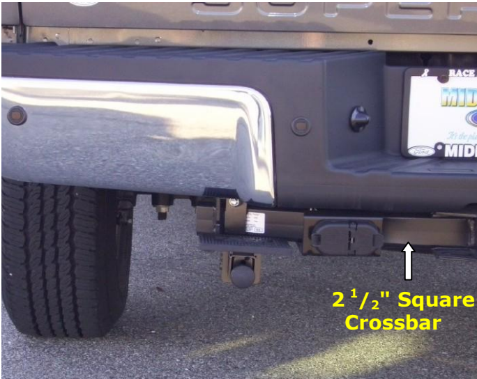
DEBO Step Installed, Stowed Position

Installation Instructions for DEBO Step Model 30200 Fits 05-11 Ford F250/F350/F450, With Factory Hitch or Equivalent. Class III/IV Hitch, 2 1/2" Sq. Crossbar Only, Not Class V, 3" Sq.