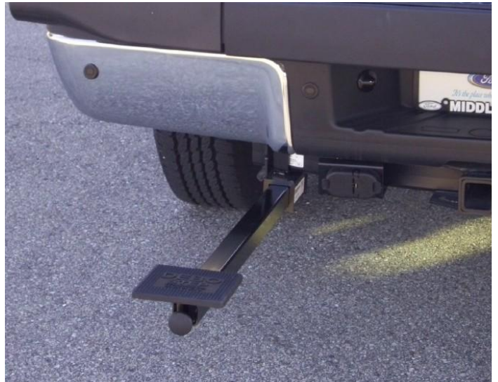
DEBO Step Extended for use with tailgate down.

Tools required for Installation: Wrenches or sockets, 3/4", 2 required.